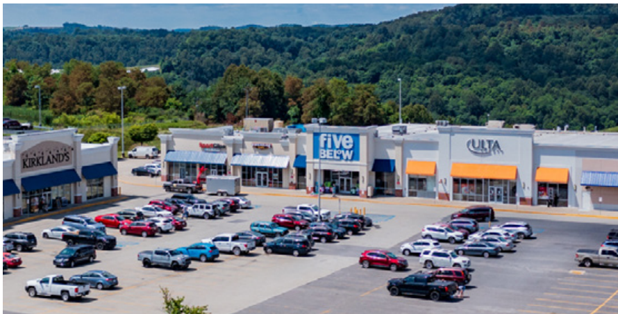
Morgantown, West Virginia