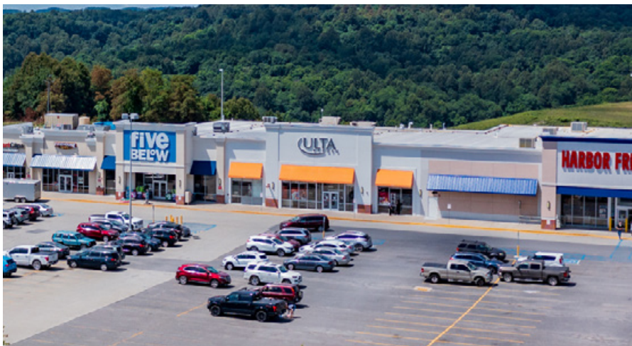
Morgantown, West Virginia