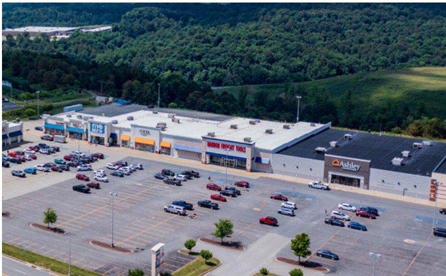
Morgantown, West Virginia